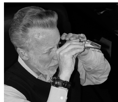
Looking through the lens to read the brix level.