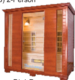
D) 4-Person Facing Bench