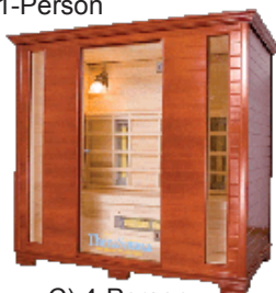
C) 4-Person Straight Bench