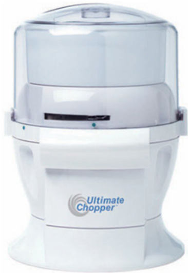
The Ultimate Chopper, The Ultimate Time-Saver

The ultimate easy-to-use kitchen tool to chop, grate, grind, pulverize and blend